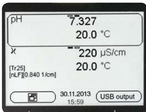
Display with two measured values