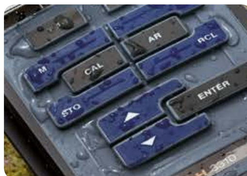
Robust sealed silicone keypad - 100% waterproof