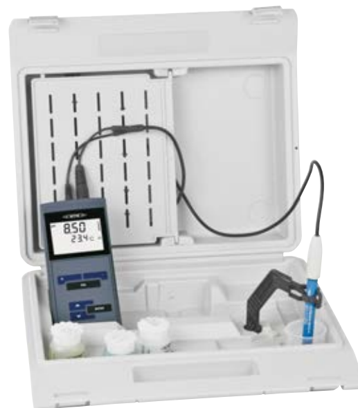
Set in case